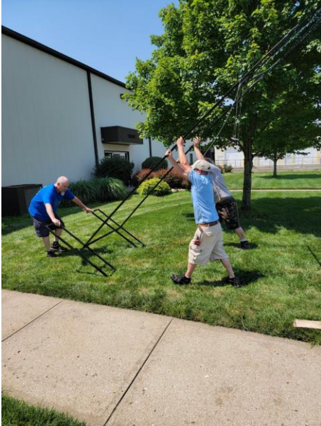
STEP 8: Stake down all 4 16' guide wires